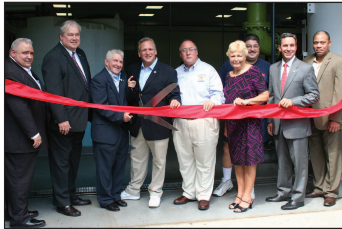
The Hicksville Water District commissioners and local officials cut the ribbon at Plant #6 with County Executive Ed Mangano.

The Hicksville Water District has undertaken several projects to increase the efficiency and productivity of its facilities. This is part of our effort to demonstrate a commitment to maintain residents' low cost-per-gallon by responsibly investing tax dollars in a system-wide capital improvement plan.