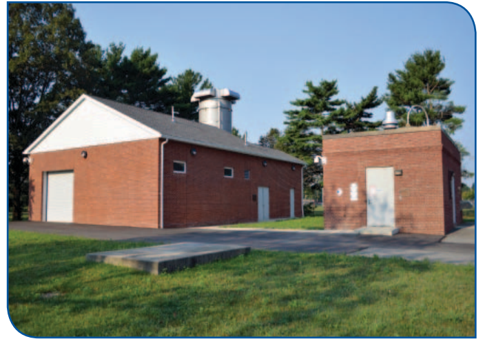
The award-winning facility utilizes a sustainable and cost-effective treatment solution to remove nitrates and VOCs from the water supply.

The nitrate treatment was achieved with the addition of a highly efficient ion exchange system. The ion exchanger removes nitrates from the water stream and generates a waste of only 0.2 percent of the treated capacity.