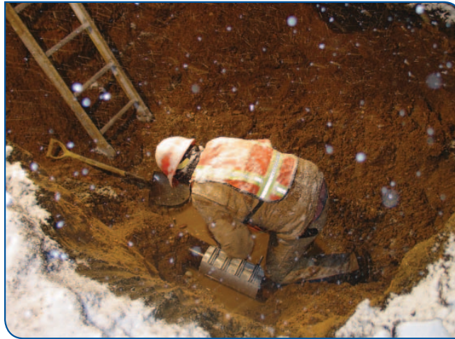
District employees are available around the clock for necessary repairs and projects.

The Hicksville Water District recently announced planned capital improvement projects for 2014 remain on schedule and on budget. The District is currently updating Plant 1 and Plant 5 and making other small repairs and upgrades to District facilities to improve the water purification process and increase operational efficiency.